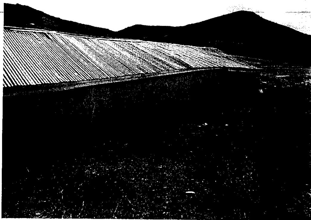
Block of four community built classrooms (rear view).